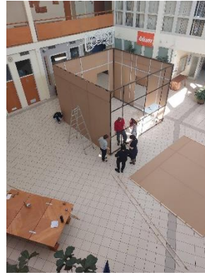
Picture2: Work in progress