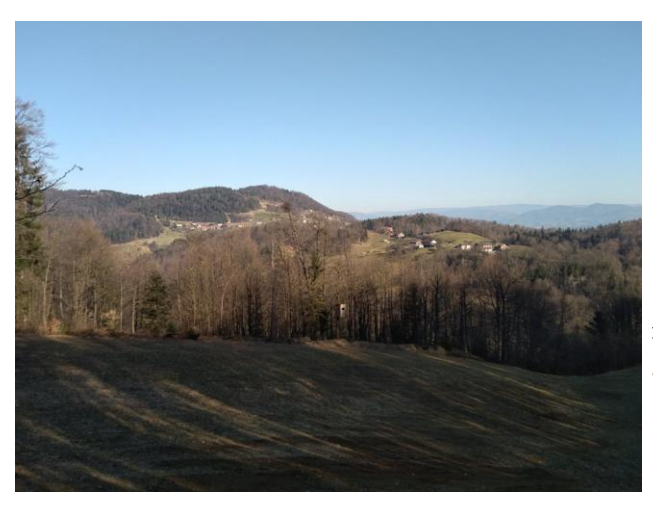
Figure 3: Land / parcel with a view Author: Nejc Goter, 2022