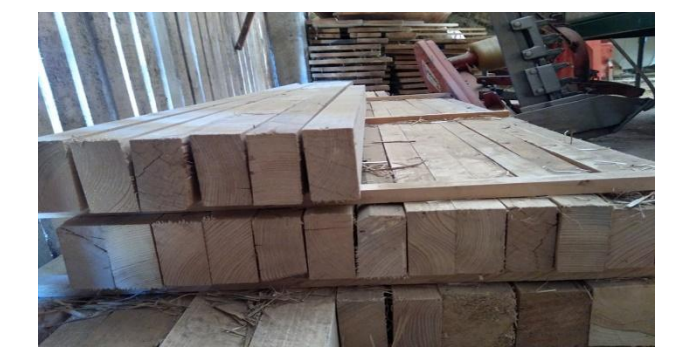
Figure 5: Construction elements prepared for building Author: Nejc Goter, 2022