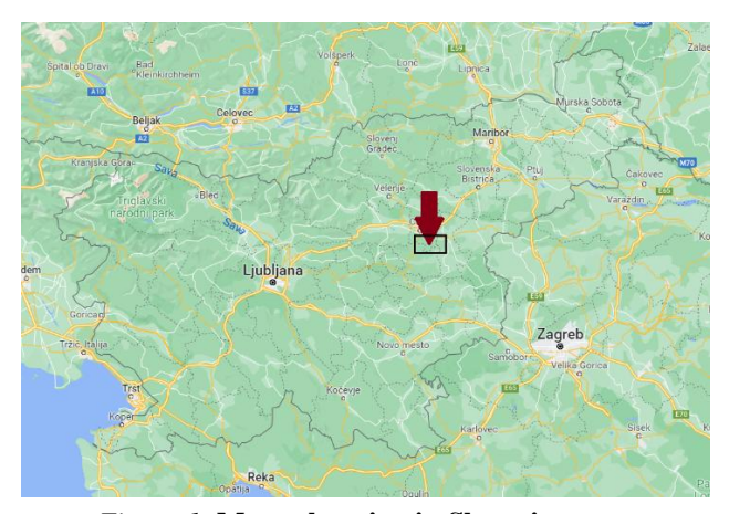
Figure 1: Macro location in Slovenia