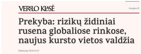
Figure 3. Headline example from Verslo žinios