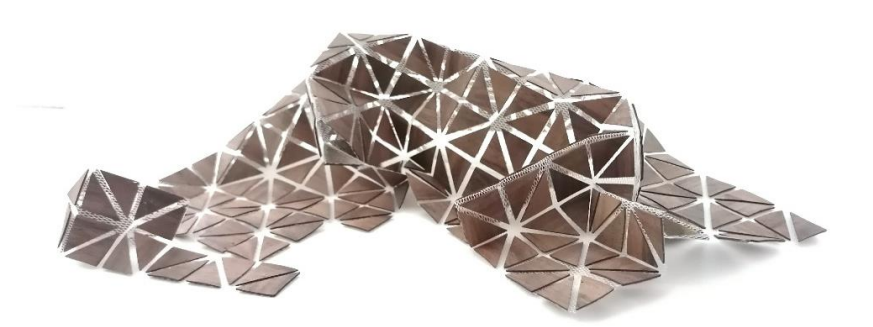
Figure 5. Wooden fabric Author: Kim Hebar