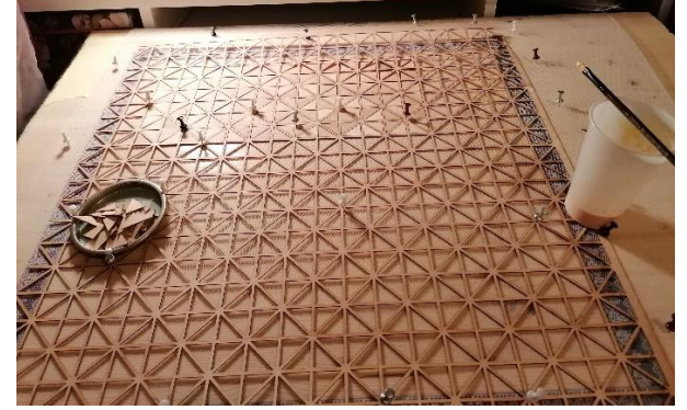
Figure 3. Making the wooden fabric Author: Kim Hebar