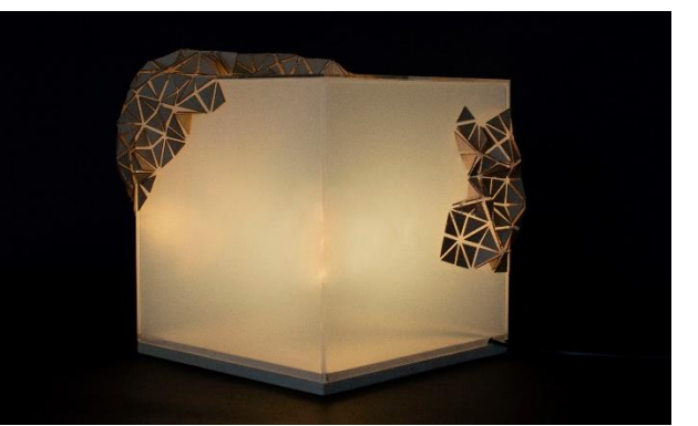
Figure 4. Finished product Author: Kim Hebar